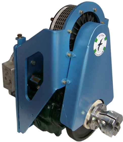
10kW Motor / 5kW Generator on PRM150 gearbox

Fits any diesel engine 20-55hp, based on the PRM150 gearbox