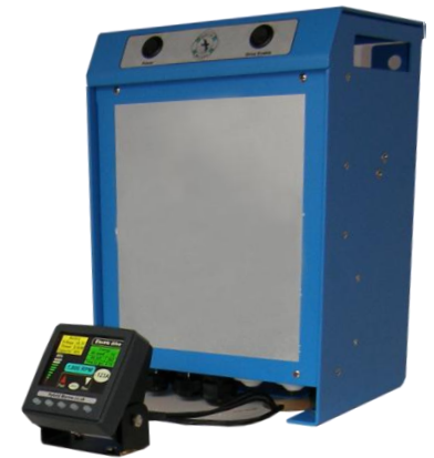
Hybrid Controller and display