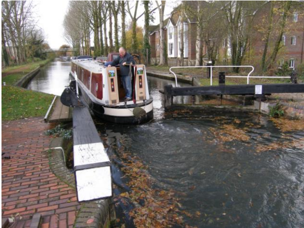
One of our canal boat systems manoeuvring under electric drive . Take a look at this link for a 5 min video. http://www.youtube.com/watch?v=iEeu5aUzBZo

By working closely with manufacturers and suppliers, Hybrid Marine are able to offer everything you need to Hybridise your canal boat in one cost effective package. This complete system provides enhanced propulsion and power supply for your boat. In short our Hybrid system makes pleasure boating more pleasurable.