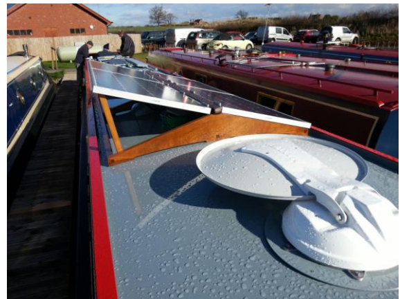
The addition of solar panels can make a significant contribution to your power needs (1kW array shown disguised as a hatch)

There is nothing quite like piloting twenty tons of boat in complete silence, there are no words to express this experience.